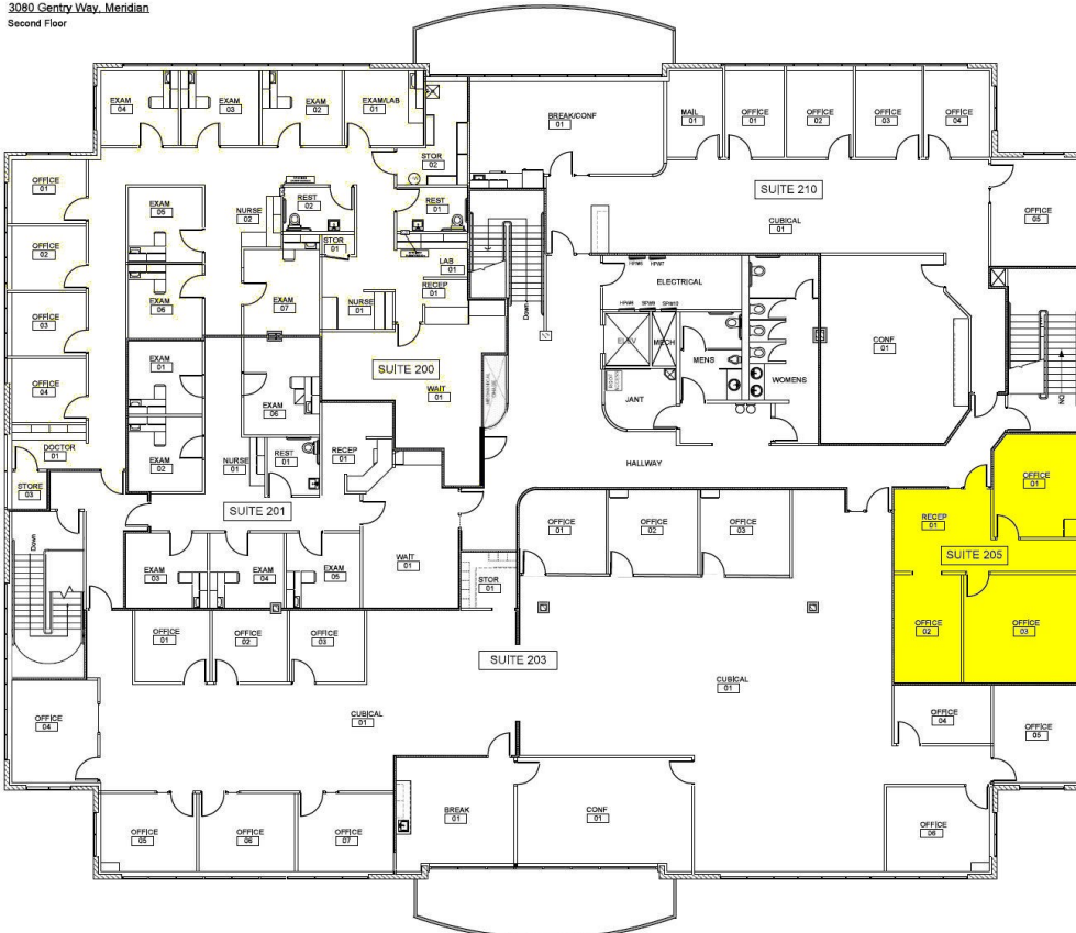
SECOND FLOOR Scale: 1/8" = 1'-0"