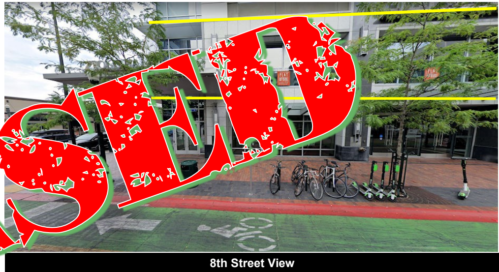
8th Street View